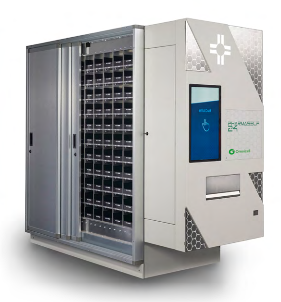
THE COMPACT AND MULTI PHARMASELF24 MODELS